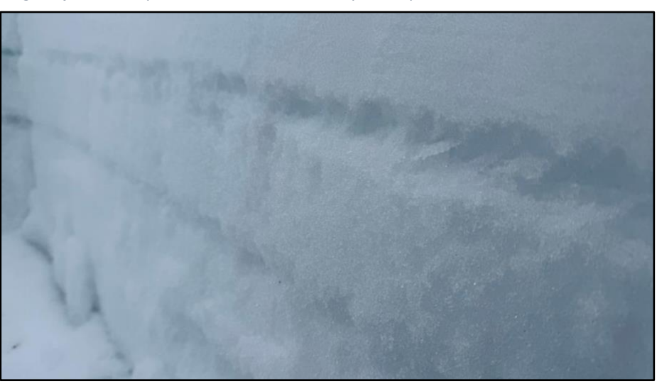
Multiple layers of buried surface hoar from early January produced avalanches all season.

During some previous seasons I have seen surface hoar grow and get buried, but it has never been as widespread as this season. I hypothesize, persistent high pressure prevented normal, strong Montana winds and allowed widespread surface hoar to grow and survive in