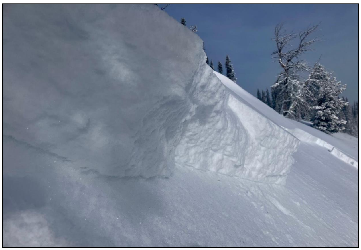
Avalanche we triggered from the flat ridge above as we walked towards the slope in Taylor Fork on January 11.

The widespread distribution of various weak layers led to widespread instability when snow fell in mid-January. Throughout our forecast area we had reports of avalanches and large collapses every day for three weeks. Many avalanches were triggered remotely, by us and public backcountry users. Widespread remote triggered activity is uncommon here in my experience.