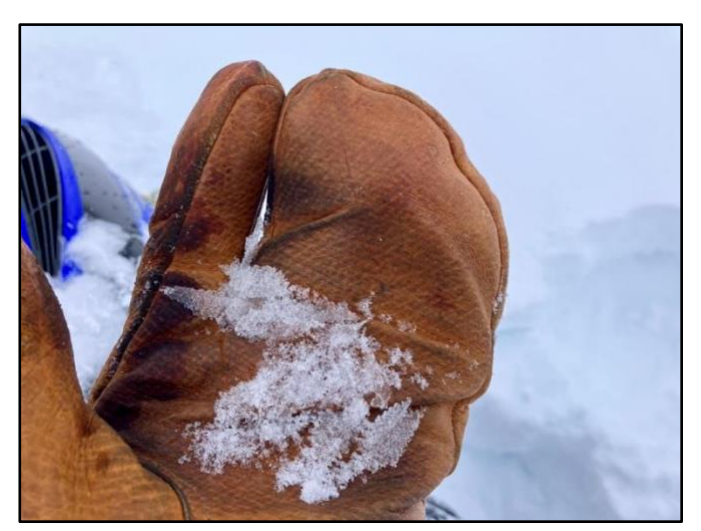
Large surface hoar crystals that were buried in early January.

The snowpack was historically low from when we started forecasts on December 7th through the beginning of February. We had long dry spells interrupted by a couple "storm cycles". Snowfall was minimal with 1-2" of SWE over a week in December, and 2-4" of SWE over 2-3 weeks in January. That was enough to create a slab and widespread avalanche activity.