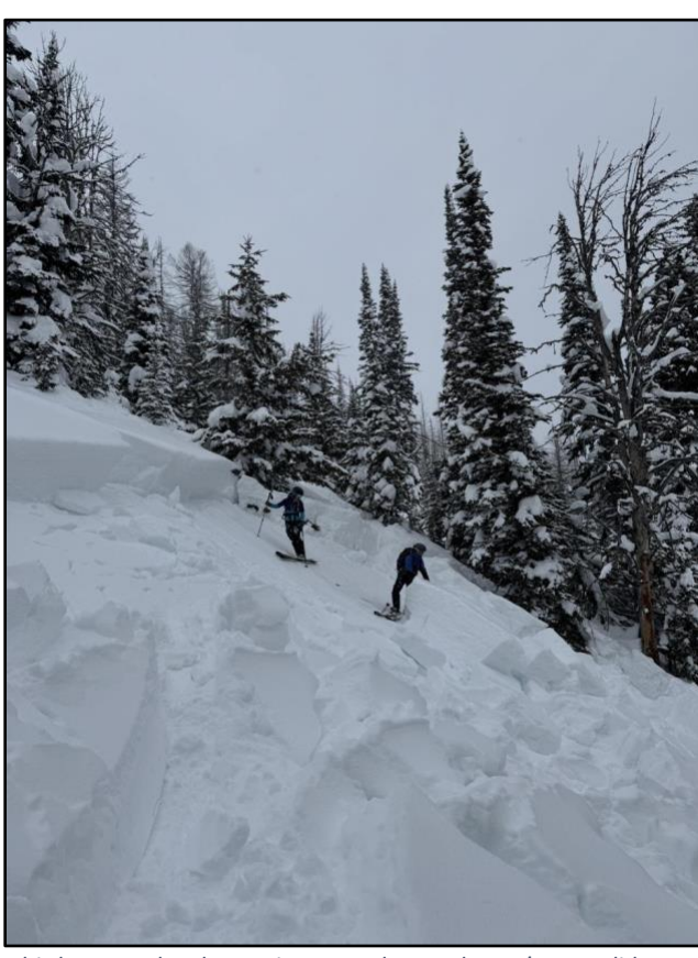
This large avalanche ran in a spot that we haven't seen slide, adjacent to a common skintrack at Bacon Rind, on March 2.

very large R4/5-D4 wet slab, 10-20' deep and around 2,000' wide. It likely propagated on the early season persistent weak layers, and occurred on a north aspect at 10,000', likely after 4-5 days of above freezing temperatures at that elevation followed by rain.