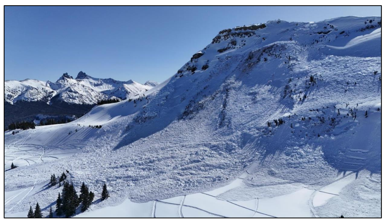
A snowmobiler triggered this huge avalanche om Henderson Mtn. near Cooke City on March 7.