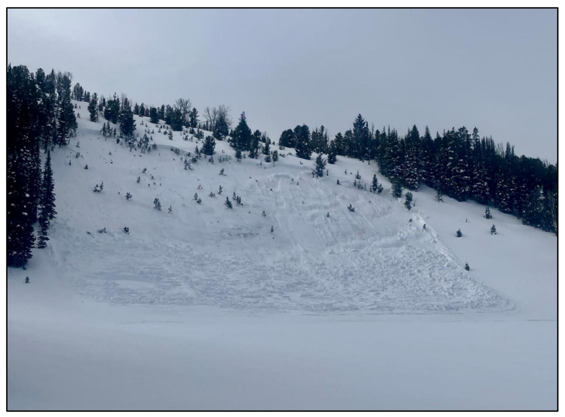
Riders triggered this avalanche from the flats near where the photo is taken, near Big Sky on February 17.

In February, snowfall picked up and the weak snowpack continued to produce large, easily triggered avalanches with any new snow. Remote triggered avalanches continued and became